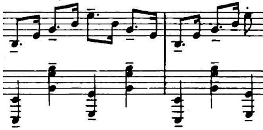
Prokofiev: Montagues and Capulets - Main Motive

Using the charts and symbol code below, label each time you hear the motive from these pieces by Prokofiev and Bernstein. If you catch more than eight, continue on the back!